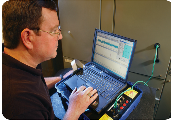
Users can acquire motor control center (MCC) data without opening the MCC door.

The outputs from the E-Plug Module to the MCC through-door connector are 5 Vac peak for both current and voltage, limiting external voltages at the MCC door to 5 Vac peak. All outputs from the E-Plug Module provide a frequency response from DC to 5 kHz. The accuracy of all outputs is +/- 3%.